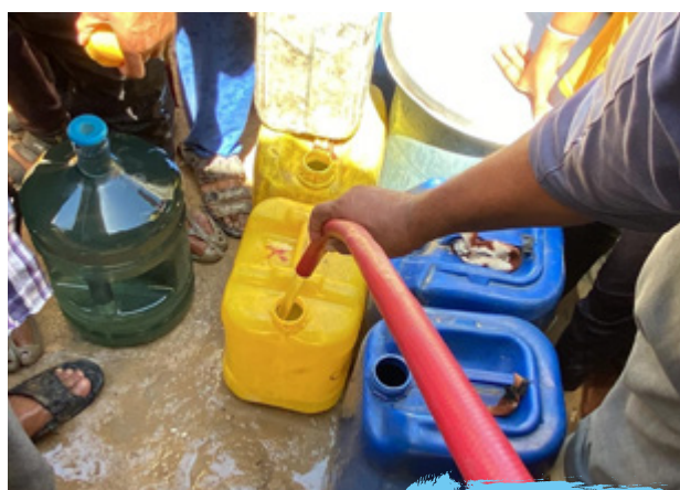
WATER REFILL TANKER